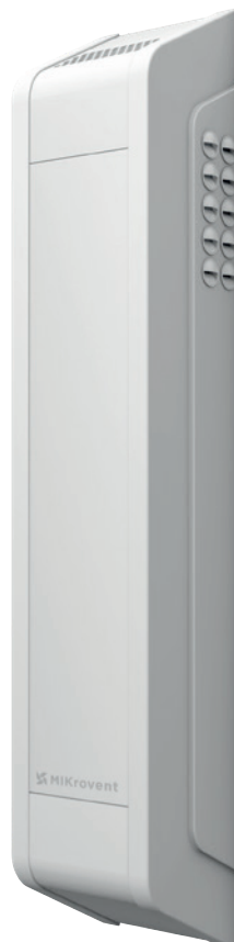
GEALAN-CAIRE® MIKrovent 60 / 120

GEALAN-CAIRE® MIKrovent 120: Airflow of 60 to 120 m 3 per hour. For large rooms (e.g. nurseries or schools). Sensors measure not only temperature and humidity, but optionally also CO 2 and VOC content.