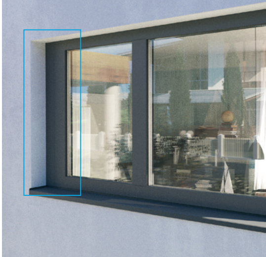
GEALAN-CAIRE® smart visibly mounted on the frame

GEALAN-CAIRE® smart is an active, decentralised ventilation system with effective heat recovery for existing and new buildings that meets the highest demands for ventilation and energy efficiency. Precise sensor technology measures air temperature and humidity and controls the fresh air supply either fully automated or in a customised way. Filters catch dust, pollen and other harmful particles. You can conveniently control GEALAN-CAIRE® smart via a mobile app from your smartphone or tablet and easily integrate it into your smart home system. The apps are available for both Android and iOS operating systems.