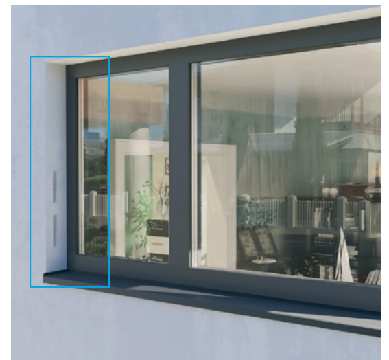
Flush-mounted installation of GEALAN-CAIRE® smart

The components for GEALAN-CAIRE® smart are available in various colours and surface finishes and adapt perfectly to your window system, inside and out. The ventilation system can be installed under the insulation and plastering. A top duct base part, which can be expanded with an adapter with a 20-mm grid, allows for easy installation in your thermal insulation composite system, no matter how thick the insulation layer is. Only the narrow air inlet and air outlet grids in the window reveal remain visible.